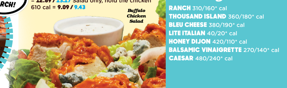
Buffalo Chicken Salad

Chopped romaine, Parmesan cheese and crispy seasoned croutons with a creamy Caesar dressing. Topped with grilled or fried chicken. Grilled 890 cal | Fried 930 cal = 12.69/13.17 Salad only, hold the chicken 610 cal = 9.09/9.43