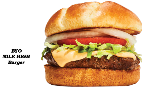
BYO Mile High Burger