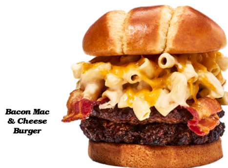
Bacon Mac & Cheese Burger