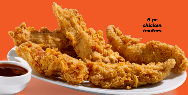
5 pc chicken tenders

Just when you thought we clucked through every idea, we come hot and crispy with another one. Tenders come with choice of one dipping sauce. Choose from Ranch, Bleu Cheese, or any of our signature wing sauces,