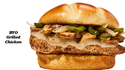
BYO Grilled Chicken