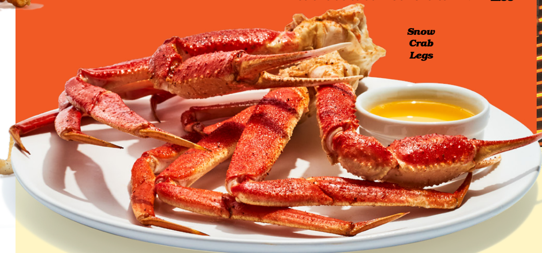
Snow Crab Legs

1 lb | 520 cal = market price when available